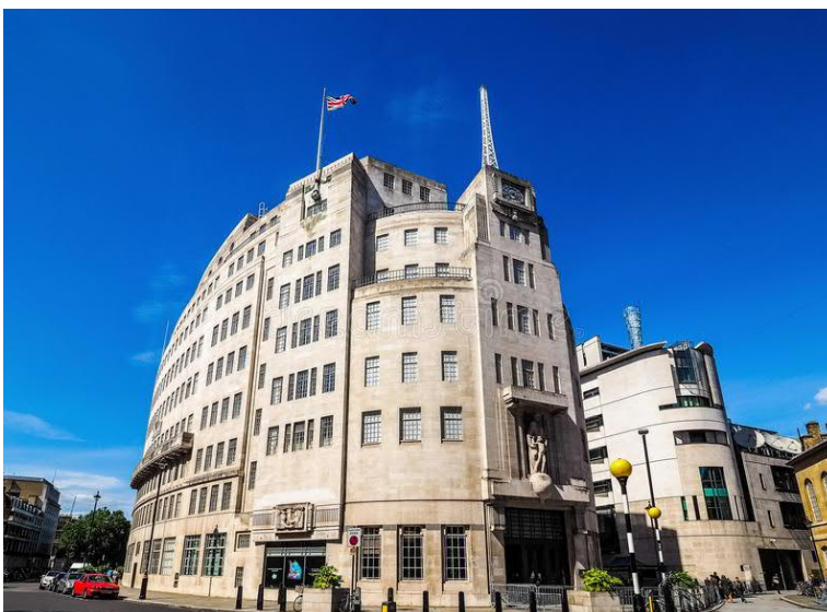
BBC Broadcasting House, London

But in a few weeks time many stations will switch over to a brief looped recording telling listeners that the MW service about to close down. These looped messages are unique, easy to hear, repeat every few minutes 24 hours a day and are 100% convincing evidence that you heard a particular station. The audio can't even be recorded from a parallel frequency or off the internet. The only place you'll hear this message is on MW.