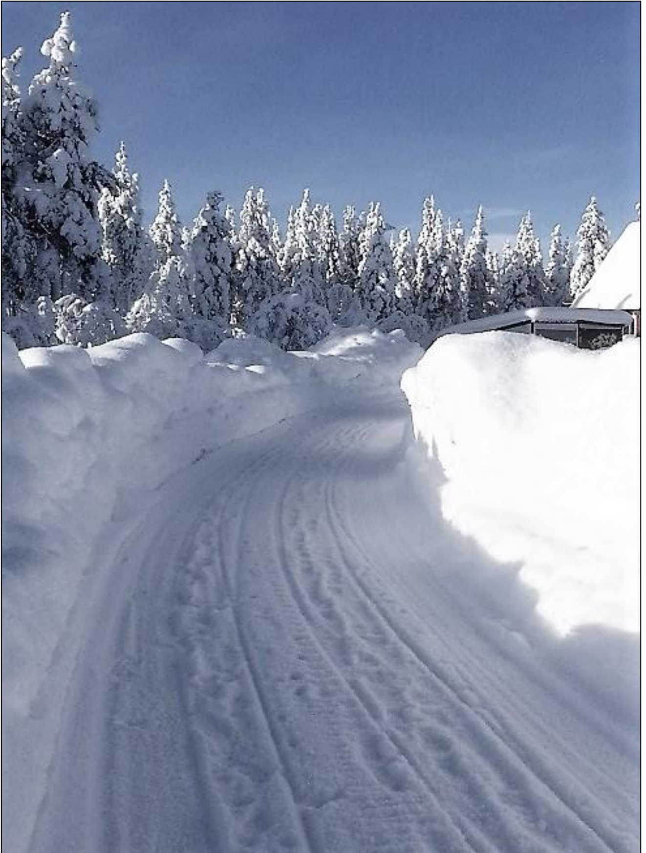
En av tre härliga vinterbilder från PAX125. Tnx BOS och LSD!