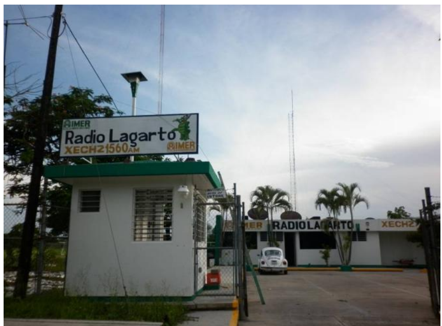
Entrada Radio Lagarto