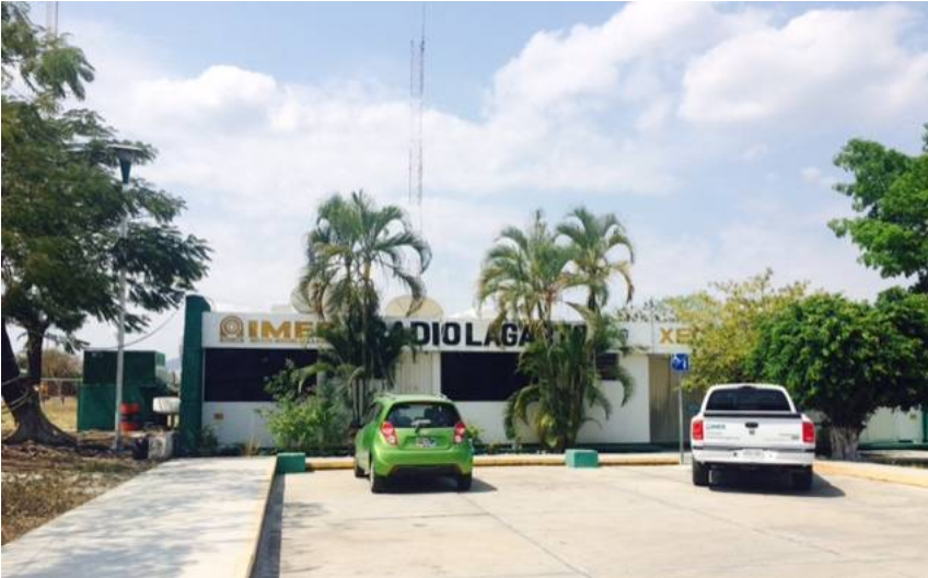
Entrada Radio Lagarto