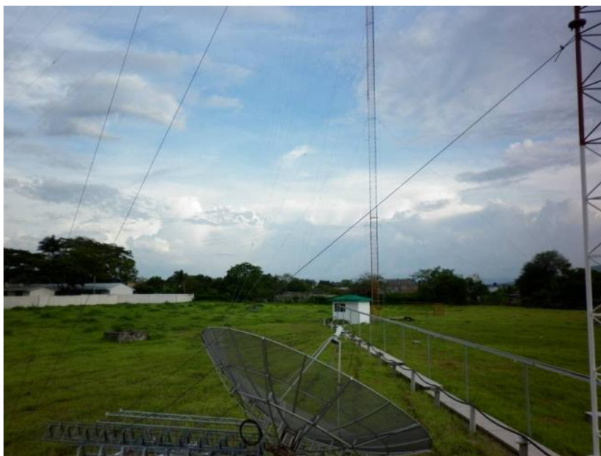
Instalaciones Radio Lagarto. Txn TBV