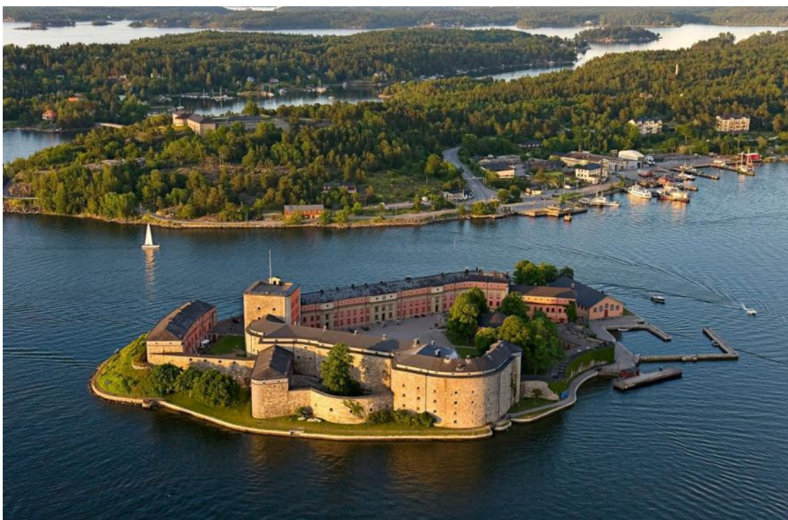
Vårt QTH augusti 2014: Kastellet utanför Vaxholm.

Anledningen till att Radio Nord Revival än en gång kom till stånd var en förfrågan från Täby Sändaramatörer, som arrangerade en ”field day” ute på Kastellet, Vaxholm lördagen den 23 augusti. En mycket radiohistorisk plats då det var härifrån som den första rundradiosändningen i Sverige genomfördes hösten 1919. Radio Nord Revival-sändningarna startade något innan denna dag och pågick fram till den 26 augusti.