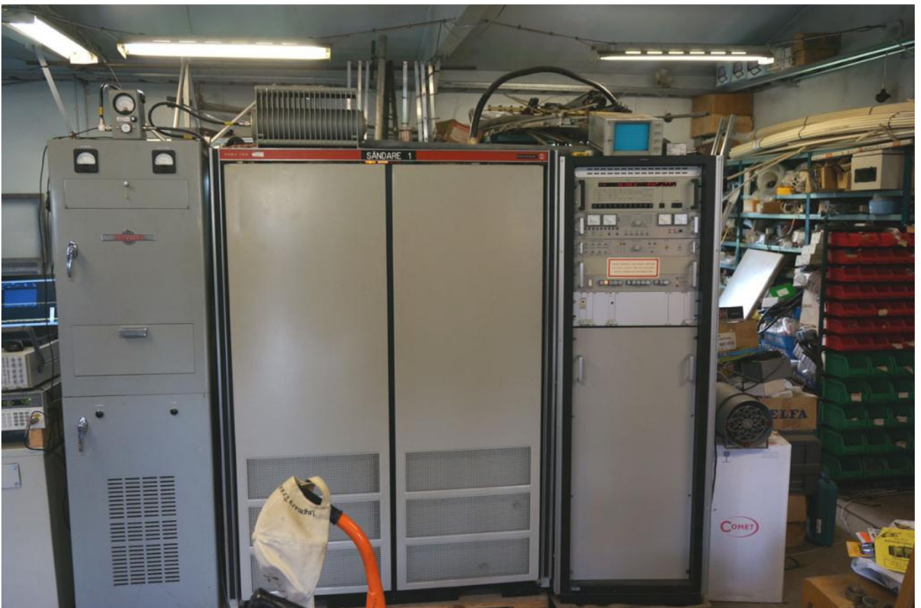
Sändarhallen i Ringvalla, Sala. Längst till vänster den Collins 5 kW-are som användes på 75 meter. De övriga tre skåpen är den 10 kW-are som nådde ut till samtliga världsdelar denna radiodag.