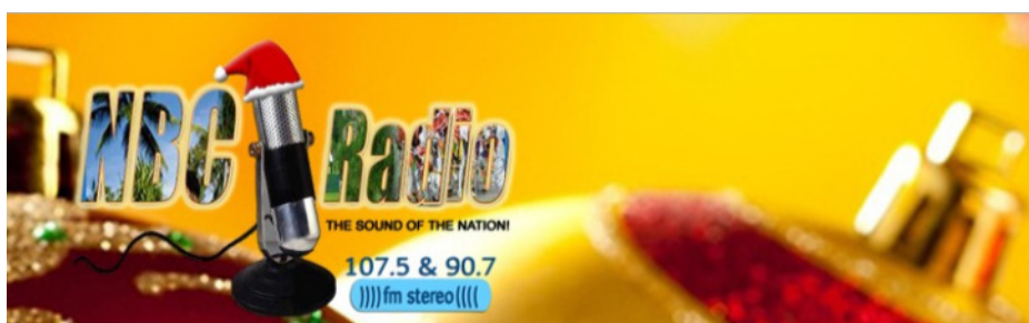
Merry Christmas from NBC, St Vincent

700 NBC Radio ceased regular operations on 700 kHz (10 kW) in 2011, but kept the transmitter operational as a backup and reactivated for disaster purposes only. Now NBC Radio no longer maintains the Medium Wave transmitter for disaster purposes. (Stig Hartvig Nielsen, WRTH Facebook Group 21.11.2014)